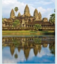
Angkor Wat is the architectural masterpiece of the Khmer Empire.