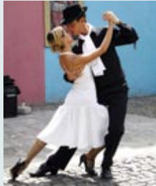
"Tango" refers to both a dance and the musical style to which it is performed.